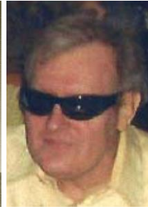
40 th Reunion