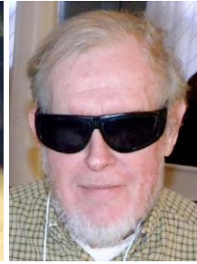
55 th Reunion