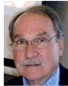
55 th Reunion