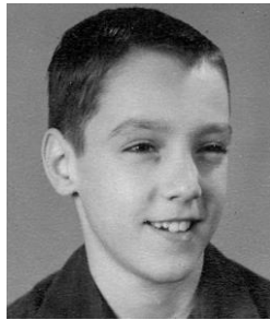
5 th Grade