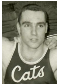
59/60 Varsity Basketball