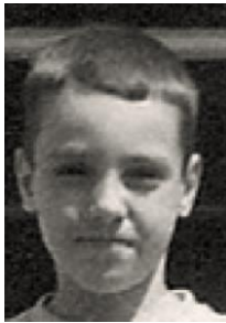
2 nd Grade